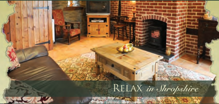
RELAX in Shropshire