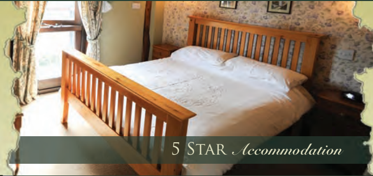
5 STAR Accommodation