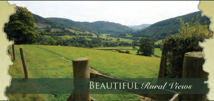
BEAUTIFUL Rural Views

BRYNCALLED BARN.S self-catering accommodation, Shropshire