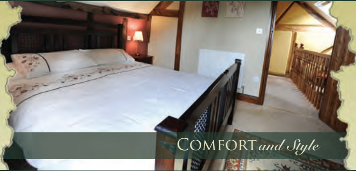
COMFORT and Style

Nestling in the heart of rural Shropshire, Bryncalled Barns is an ideal base for you to explore Shropshire, Herefordshire and Mid Wales.